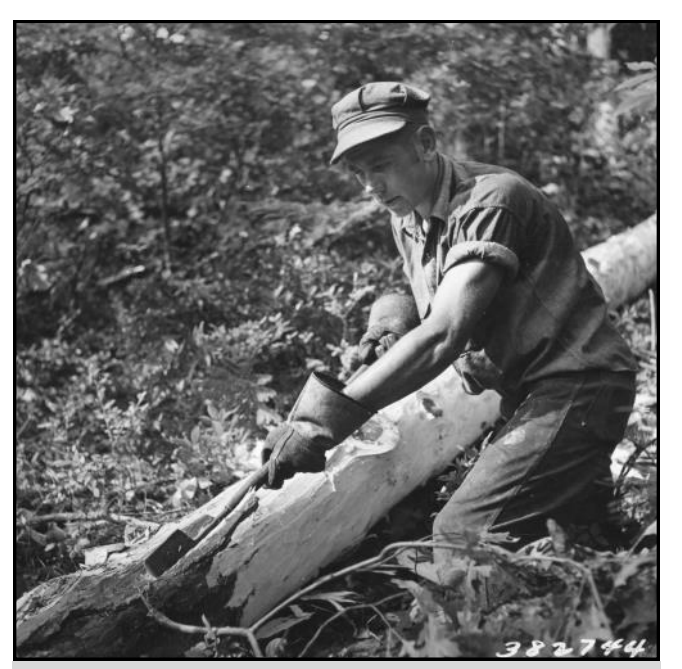
Historically, the Appalachian forests sustained local settlers and provided raw materials for America's economic expansion .

In November, the senators introduced the West Virginia National Heritage Area Act of 2013, which would designate AFHA as a National Heritage Area. The new Appalachian Forest National Heritage Area would include 16 counties in the West Virginia highlands and 2 counties of western Maryland. In addition, the bill extends funding eligibility for the existing National Coal Heritage Area and Wheeling National Heritage Area, also in West Virginia.