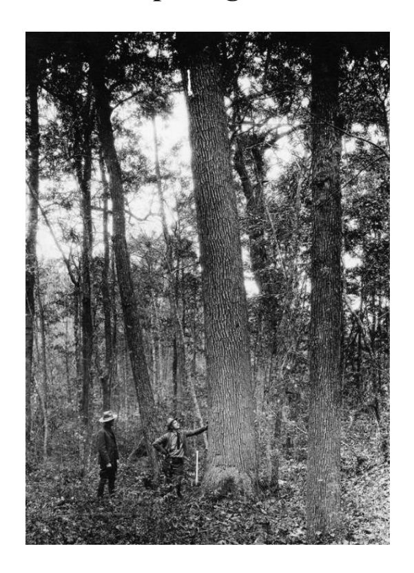
Exhibit Opening: "Discovering the Appalachian Forest"

AFHA is proud to unveil a new exhibit to the public: Discovering the Appalachian Forest. Both modern and historic photos tell the story our forest: its natural splendor, its historic significance, its place in industry, and its influence on local lives and hearts. Come see Discovering the Appalachian Forest for the first time, on display at the Darden Mill in Elkins (2 1/2 Railroad Avenue). There will be an open house on Friday, November 8th from 4pm - 6pm and on Saturday, November 9th from 10am - 4pm. The event is free of charge, but donations are welcome! Questions? Email info@appalachianforest.us. And after the open house, don't forget to come to: