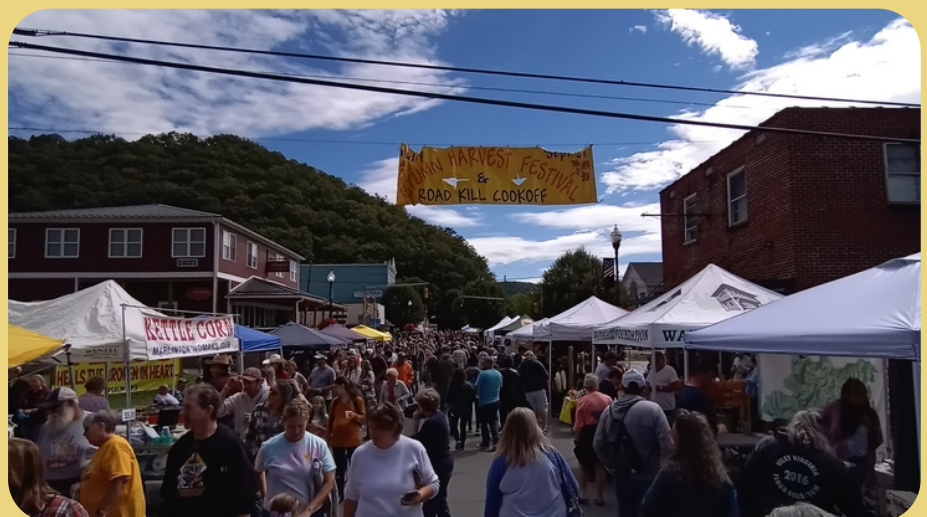
Roadkil Cookoff and Fall Festival in Marlinton

And that's just one of many great events in our region. Read on to find more seasonal events and learn how to take in the Autumn scenery with our Hiking Challenge!