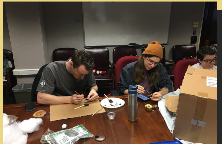
AFNHA AmeriCorps members painting models