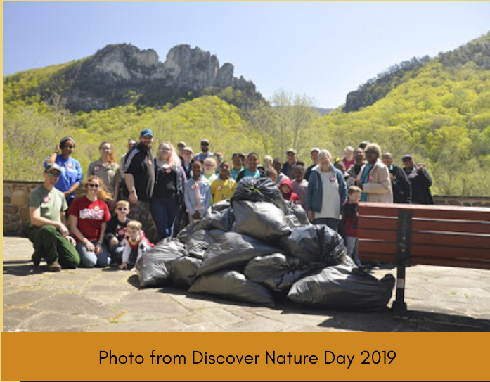
Photo from Discover Nature Day 2019

Discover Nature Day is back for its 9th year, this time with a twist! We have moved to a virtual event this year in order to promote safety. The event, organized with the Potomac Highlands Cooperative Weed and Pest Management Area (PHCWPMA), is usually a day geared toward K-5th grade children who want to learn more about the natural world. This year it will be an entire week of virtual content, June 20th -27th. Join us to learn about our state's unique and wonderful wildlife through crafts, interactive videos, and live animal presentations!