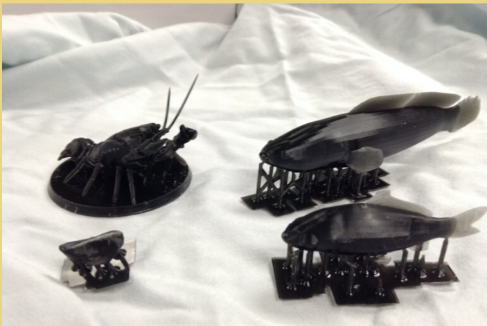
3D models of invasive species printed by D&E College

To prepare for the CWPMA educational classes that both Hannah Wroton (Potomac Highlands CWPMA) and Rachel Rosenberg (Rivers & Gorges CWPMA), a craft day was held to make educational materials! All hands were on deck. Photos continued on next page.