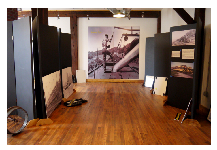
Installation of the Virginian exhibit in progress.

In doing my service, I wear many hatsâ€"though none of them is a conductor's hat. I perform visitor services duties, update social media, catalog artifacts, and the odd administrative task. As this year marks the grand opening of the museum, I've spent a lot of time in exhibit research and design mode. I've been able to see complete transformation of the Darden Mill's second floor, and am currently designing and installing this season's exhibit, "The Virginian Railway: The Best Coal Railroad Money Could Buy.â€□