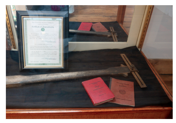
Artifacts on display include several company rule books, a track gauge, an apprentice's certificate, company paperwork and coal mining equipment.

For the past six months, I've been serving as the AFHA AmeriCorps member at the fledgling West Virginia Railroad Museum. Located in the historic Darden Mill in Elkins, the museum's mission is to preserve and archive West Virginia's railroading history. The collection includes rolling stock (vehicles that move on a railway such as engines, passenger cars, and cabooses) as well as tools, photographs, books, and paper ephemera.