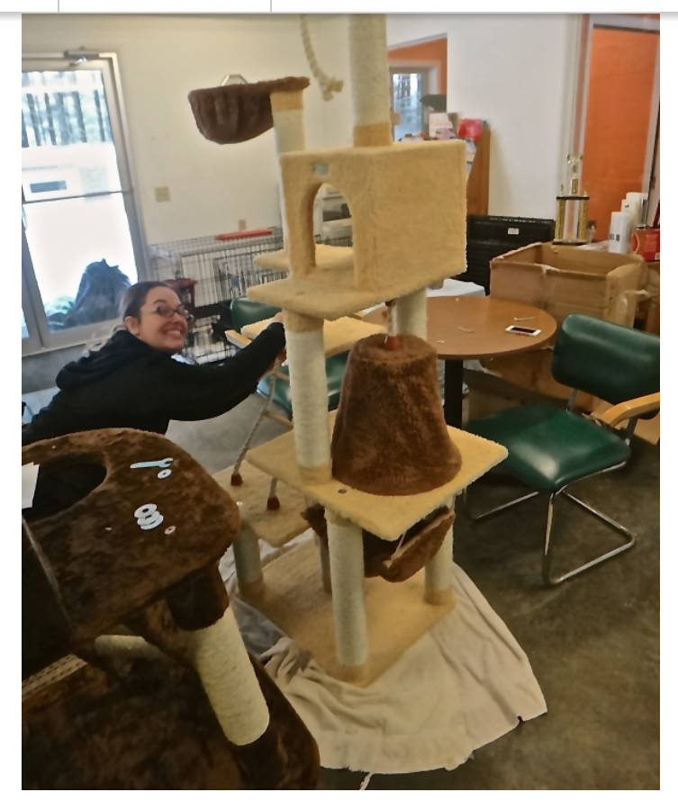
The hands-on team built cat trees for their MLK service project at the Barbour County Friends of Animals shelter.

Copyright © 2015 Appalachian Forest National Heritage Area, All rights reserved.