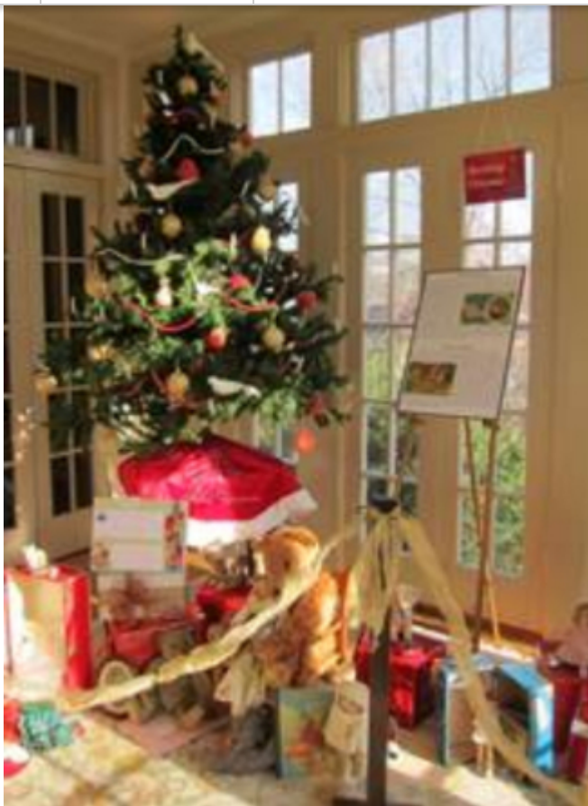
The Becoming Christmas Exhibit, North House Museum, Lewisburg,. September 2014.