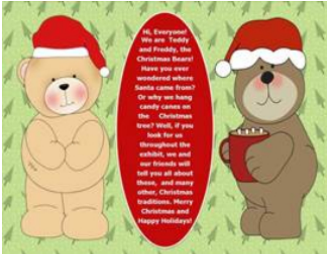
Teddy & Freddy, the Christmas Bears

For more than a month, I have been researching Christmas and putting together the Becoming Christmas exhibit for the Greenbrier Historical Society (GHS). The exhibit opened on November 23, 2014, and will be available until January 3, 2015.