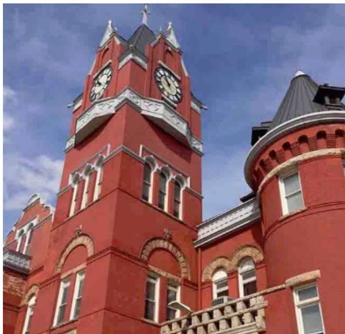
The Tucker County Courthouse, in Parsons, WV.

development professional and relatively new Tucker County resident.